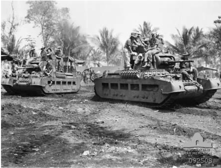
Netherlands East Indies: Halmahera Islands, Morotai, Officers and men of 2/43 Infantry Battalion riding on a Matilda tank of 9 Troop, B Squadron, 2/9 Armoured Regiment, during preparations for the OBOE 6 operation.