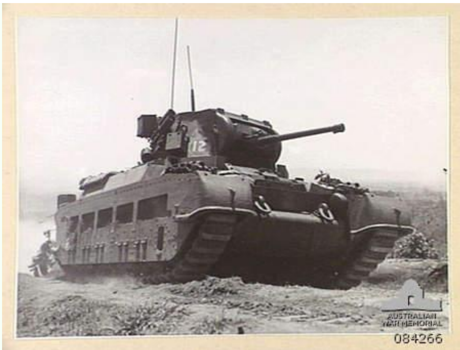
Malanda area, Queensland . 11 December 1944. Csquadron, 2/9 Armoured Regiment Matilda tanks in movement along the Glen Allyn road to the final assault against Lamond's Hill and the conclusion of exercise "RAMPANT".