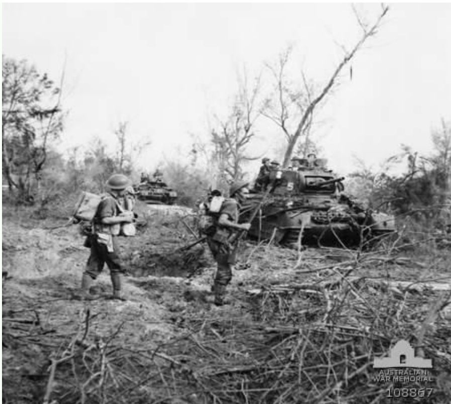
Labuan, North Borneo, 10 June 1945. Matilda tanks of B squadron, 9 Troop, 2/9th Armoured Regiment, moving east soon after the OBOE 6 operation landing.