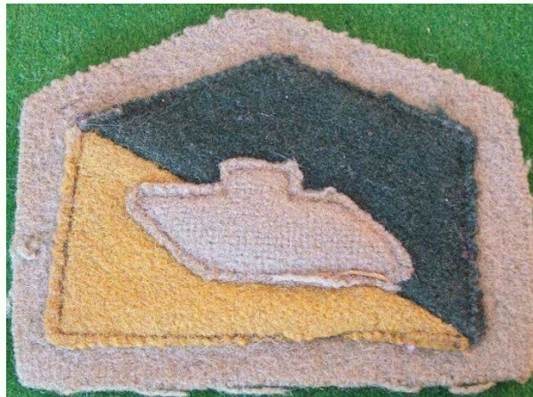
2nd/9th Australian Armoured Regiment colour patch (1944)