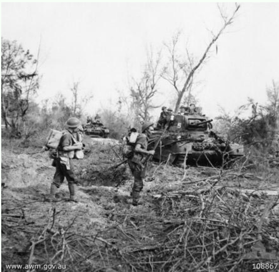
9 Troop, B Squadron, 2nd/9th Australian Armoured Regiment Matilda Tanks - moving east Labuan, Borneo 10 June 1945.