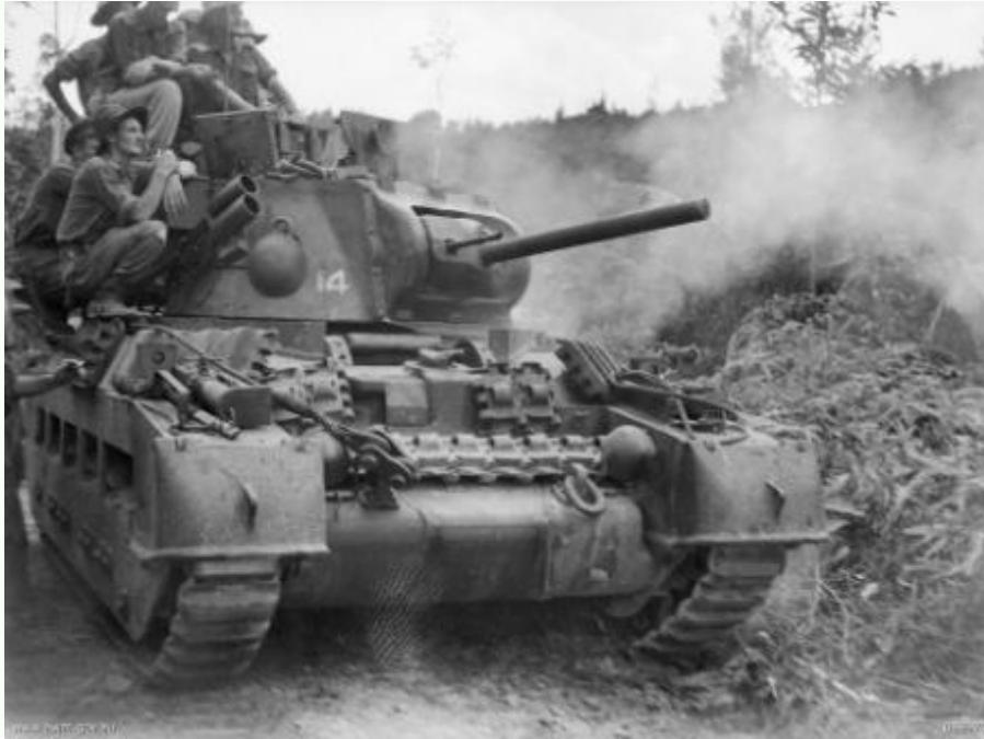
Snags track, Tarakan . 20 May 1945. one of the 14 troop Matilda Mk II tanks of 2/9 armoured regiment firing its three inch howitzer at a Japanese pillbox forward of c company 2/23 infantry battalion positions on the elbow. The fire of this howitzer is directed by phone reports from the forward troops