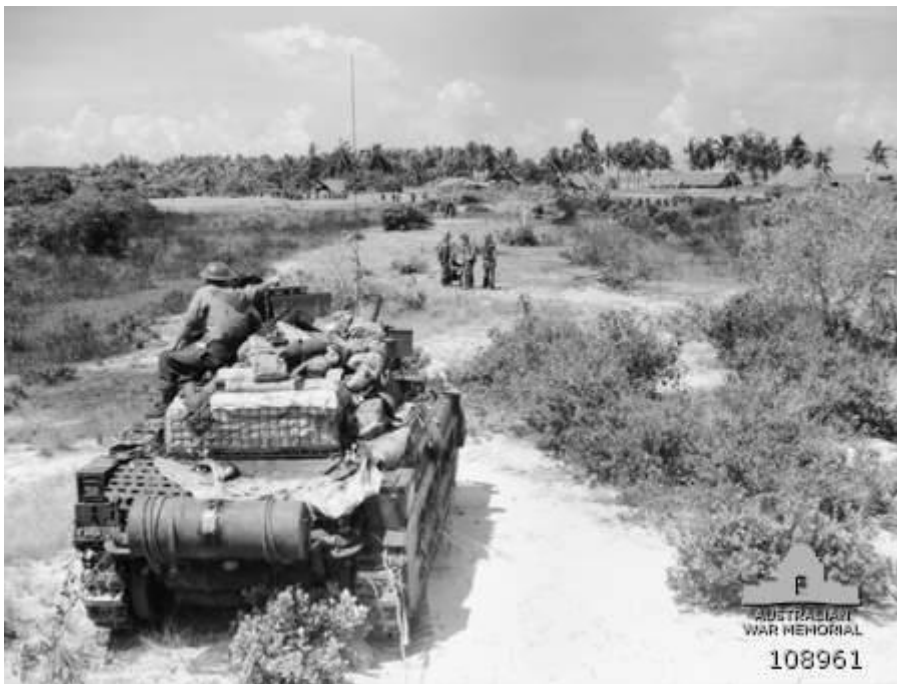
Brunei, north Borneo, 10 June 1945. Tanks and personnel of A Squadron, 2/9 Armoured Regiment, approaching the town of Brooketon as the unit moves forward to support 2/17 Infantry Battalion during the OBOE 6 operation.