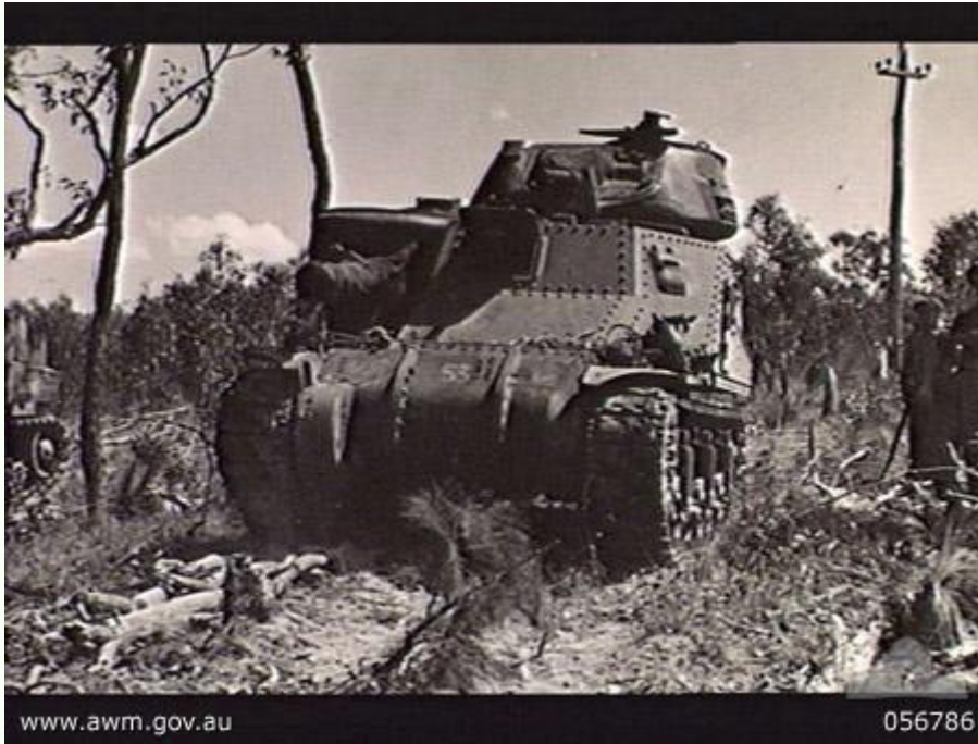
2nd/9th Australian Armoured Regiment M3 Grant Tank - on exercise near Herberton, Qld 19 August 1943.