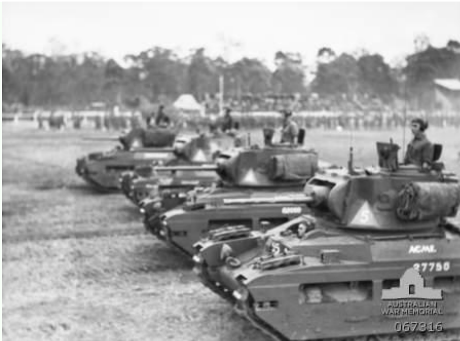
Wondecla, Queensland, Australia. 17 July 1945. tanks of "A" squadron, 2/9th Armoured Regiment moving past the saluting base as VX1 General Sir Thomas Blamey, GBE., KCB., CBG., DSO., ED., commander-in-chief, allied land forces, south west pacific area, takes the salute.