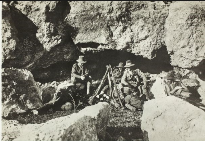
AN OUTPOST NALIN PALESTINE 3rd A.L.H.